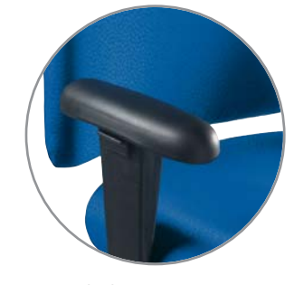
ErgoGel (OJ): Global's optional height adjustable, kidney shaped conforming gel armrests offer high shock absorption, and years of durable use. Armrests support and help reduce neck and shoulder strain.

"All backrests should provide adequate lumbar support and buttocks clearance. For tasks requiring upper body mobility, the backrest should provide adequate back support, but not interfere with the user's movement (typically these backs should not be higher than the bottom of the user's shoulder blades). For users who prefer reclining postures, or more upper back support, the back height should provide support for the shoulder blades".